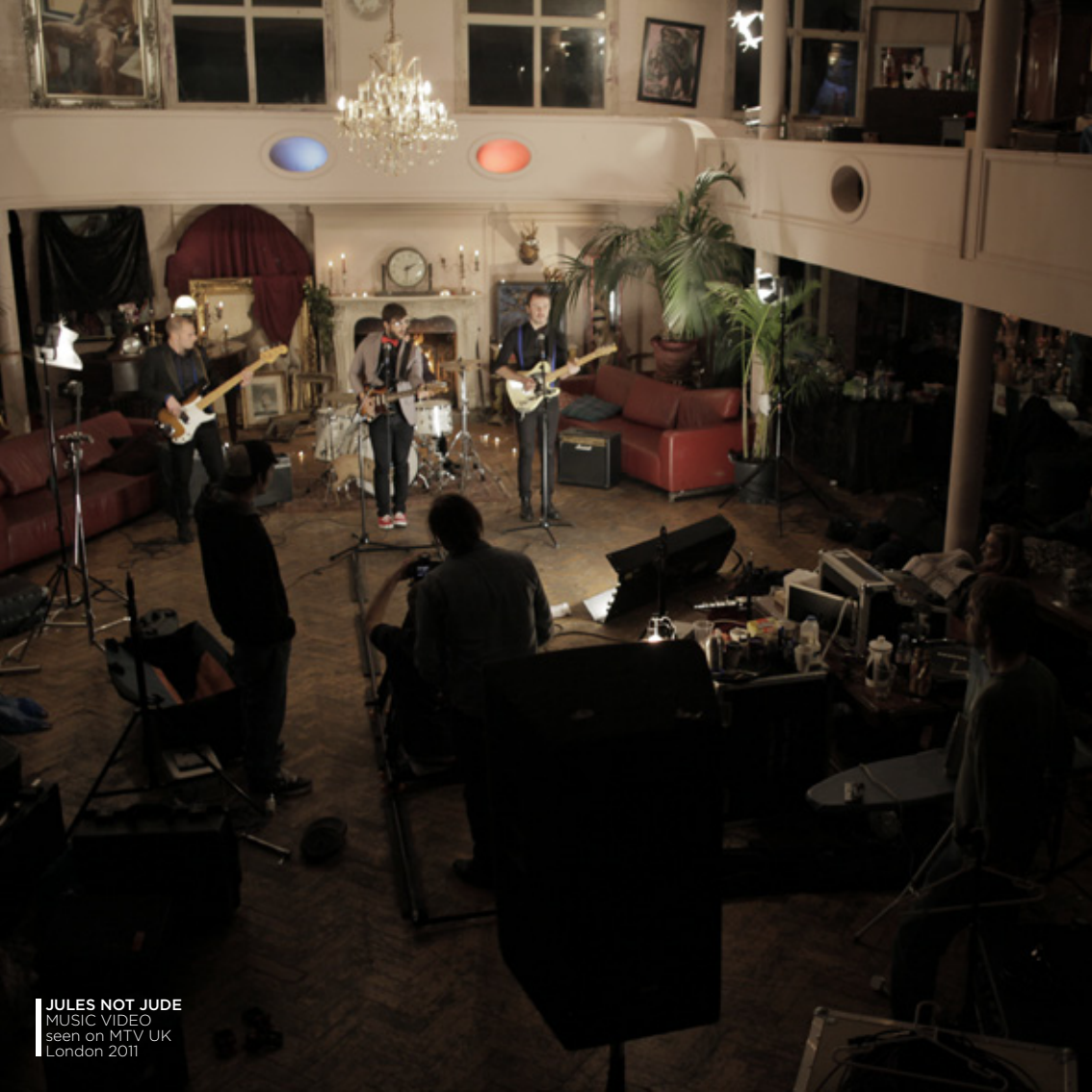
JULES NOT JUDE MUSIC VIDEO seen on MTV UK London 2011